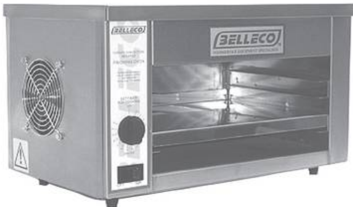
MODEL JW1 OVEN SHOWN